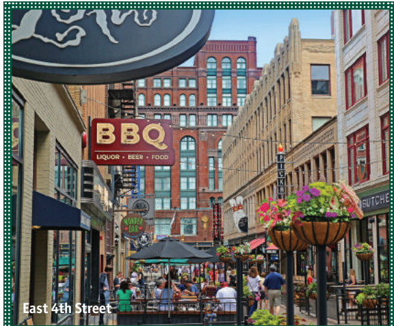
East 4th Street